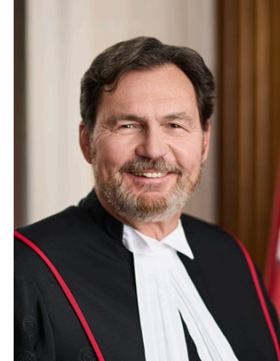
The Right Honourable Richard Wagner Chief Justice