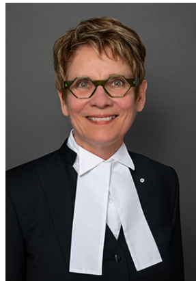
The Honourable Raymonde Gagné Speaker of the Senate