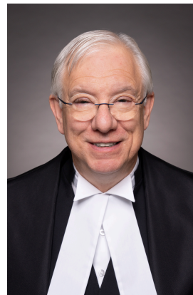
The Honourable Francis Scarpaleggia Speaker of the House of Commons