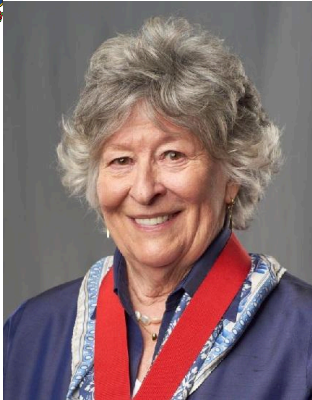
Her Excellency The Right Honourable Louise Arbour Governor General