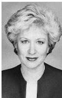
The Right Honourable Kim Campbell 4 months