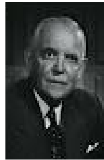
The Right Honourable Louis St. Laurent 8 years, 7 months