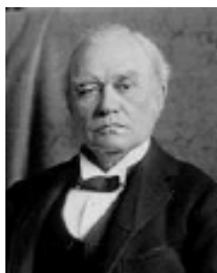
The Honourable Sir John Abbott 1 year, 5 months