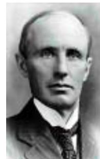
The Right Honourable Arthur Meighen 1 year, 8 months