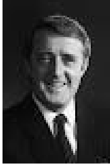
The Right Honourable Brian Mulroney 8 years, 9 months