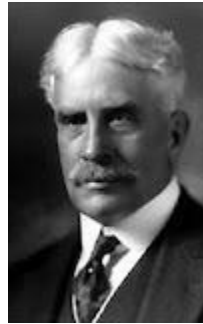
The Right Honourable Sir Robert Borden 8 years, 8 months