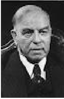
The Right Honourable W. L. Mackenzie King 21 years, 5 months