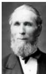
The Honourable Alexander Mackenzie 4 years, 11 months