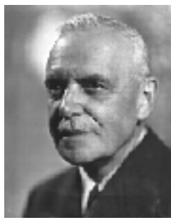
The Right Honourable Louis Saint-Laurent 8 years, 7 months