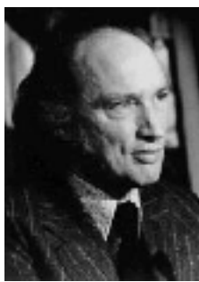
The Right Honourable Pierre Elliott Trudeau 15 years, 5 months