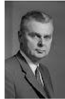
The Right Honourable John Diefenbaker 5 years, 9 months