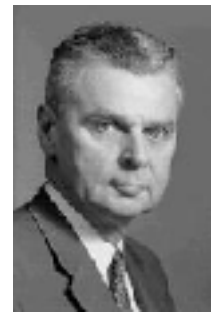
The Right Honourable John Diefenbaker 5 years, 9 months