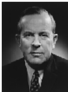
The Right Honourable Lester B. Pearson 4 years, 11 months