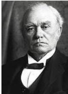
The Honourable Sir John Abbott 1 year, 5 months