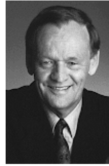
The Right Honourable Jean Chrétien 10 years, 1 month