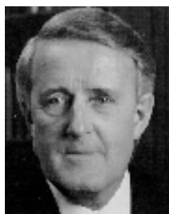
The Right Honourable Brian Mulroney 8 years, 9 months