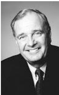
The Right Honourable Paul Martin, Jr. 2 years, 1 month