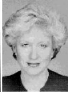
The Right Honourable Kim Campbell 4 months, 9 days