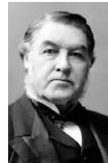
The Honourable Sir Charles Tupper 2 months