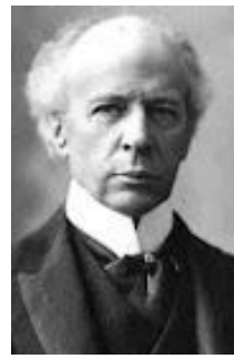
The Right Honourable Sir Wilfrid Laurier 15 years, 2 months