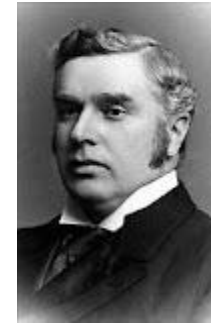
The Right Honourable Sir John Thompson 2 years