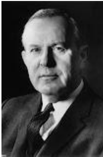
The Right Honourable Lester B. Pearson 4 years, 11 months