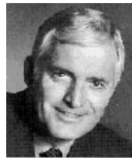
The Right Honourable John Turner 2 months, 17 days