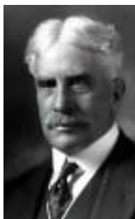
The Right Honourable Sir Robert Borden 8 years, 8 months