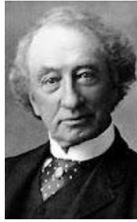
The Right Honourable Sir John A. MacDonal 18 years, 11 months