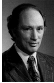
The Right Honourable Pierre Elliott Trudeau 15 years, 5 months