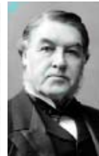
The Honourable Sir Charles Tupper 2 months, 7 days