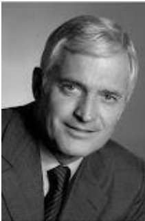
The Right Honourable John Turner 2 months