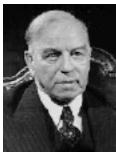
The Right Honourable W. L. Mackenzie King 21 years, 5 months