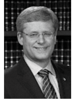
The Right Honourable Stephen Harper 9 years, 9 months