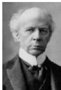
The Right Honourable Sir Wilfrid Laurier 15 years, 2 months