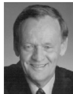
The Right Honourable Jean Chrétien 10 years, 1 month