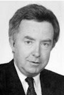
The Right Honourable Joe Clark 9 months