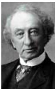
The Right Honourable Sir John A. MacDonal 18 years, 11 months