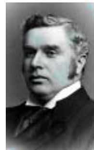
The Right Honourable Sir John Thompson 2 years