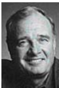
The Right Honourable Paul Martin 2 years, 1 month