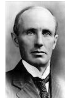
The Right Honourable Arthur Meighen 1 year, 8 months