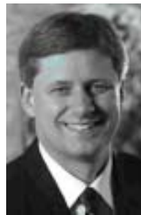
The Right Honourable Stephen Harper 5 years, 11 months*