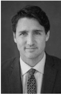
The Right Honourable Justin Trudeau 9 years, 4 months