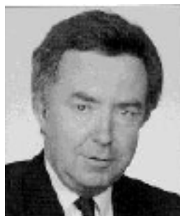
The Right Honourable Joe Clark 8 months, 28 days