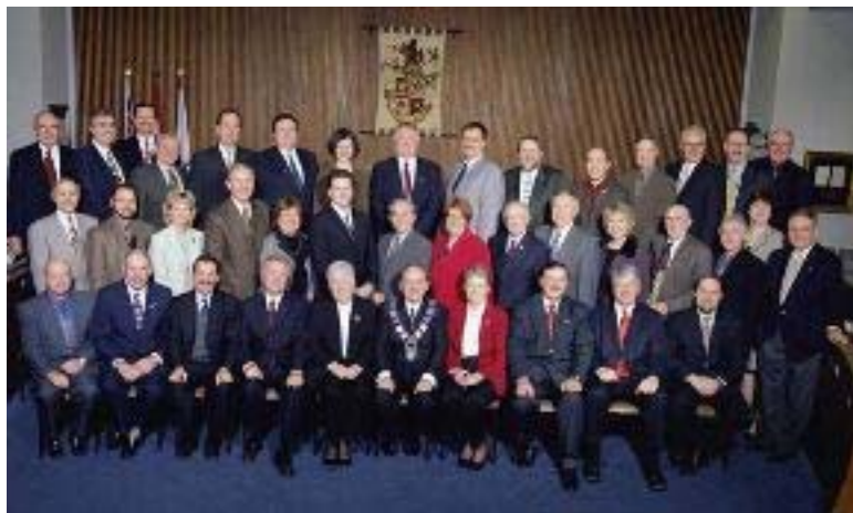
Durham Regional Council