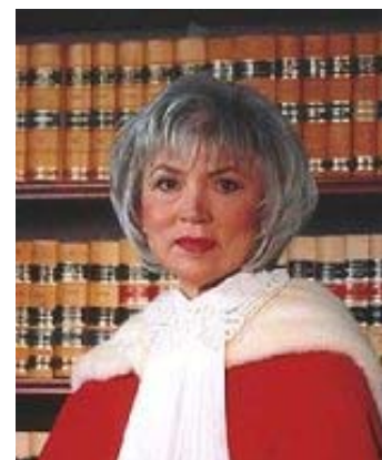
The Right Honourable Beverley McLachlin Chief Justice