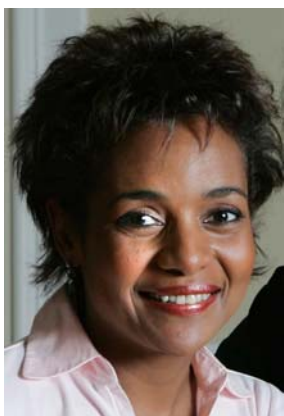
Her Excellency The Right Honourable Michaëlle Jean Governor General