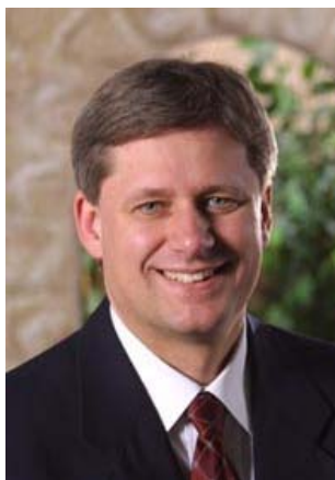
The Right Honourable Stephen Harper Prime Minister