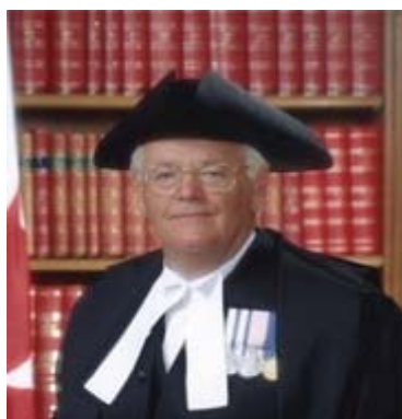
The Honourable Noel Kinsella Speaker of the Senate