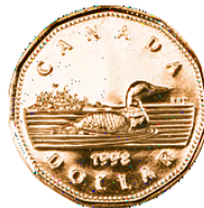
1 dollar coin "Loonie"