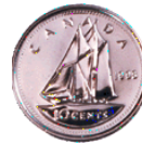
10 cent piece "Dime"