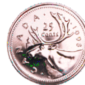
25 cent piece "Quarter"