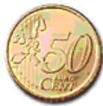
50 cent piece