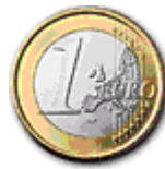
1 Euro coin