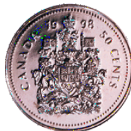
50 cent piece