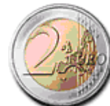
2 Euro coin