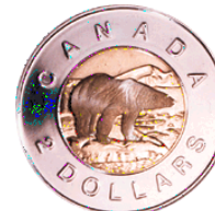
2 dollar coin "Toonie"