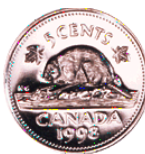
5 cent piece "Nickel"