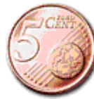
5 cent piece