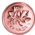
1 cent piece "Penny"