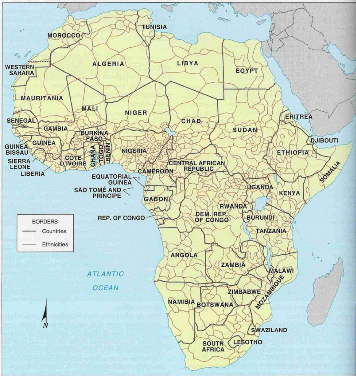
Figure 7-21 Ethnicities in Africa. The boundaries of modern African states do not match the territories long occupied by thousands of ethnic groups. State boundaries derive from the administrative units imposed by European colonial powers a century ago.